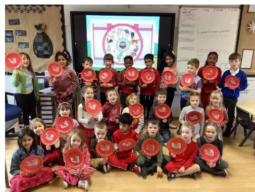
The order of the Chinese zodiac from 2008 are: