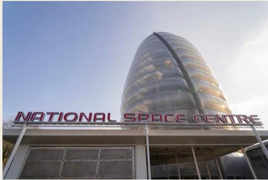
The National Space Centre, Leicester

On the 22 nd of April, we were lucky enough to visit the National Space Centre in Leicester. There were so many amazing things to see and we learnt so many interesting facts. Did you know the first animal to go to the moon was a dog?! We got to see a real rocket, a moon rock, and the special suits astronauts wear when they go into space. The planetarium show was so cool and it felt as if we were actually travelling in space. If you're ever in Leicester, you should go and check it out!