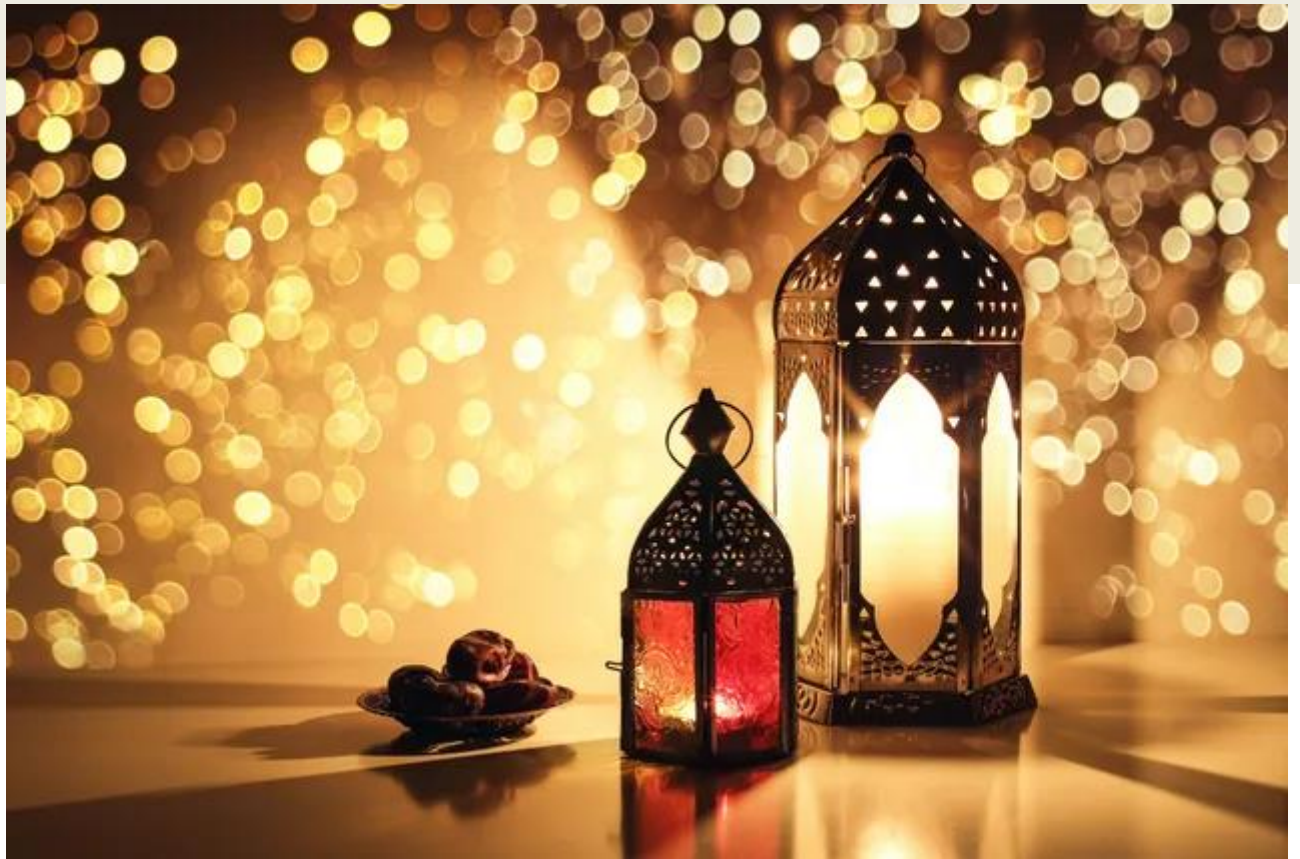
Ramadan is the ninth month of the Islamic calendar.

In this issue we have a very exciting surprise: we have a travel and culture special! We have made this newspaper about culture and different places to celebrate the wonderful world we live in. We have also asked all students across the school to contribute to our second edition of the newspaper. We were thrilled with the reports that came in and hope you will be just as entertained reading them. Now enough of us talking, time to get reading!